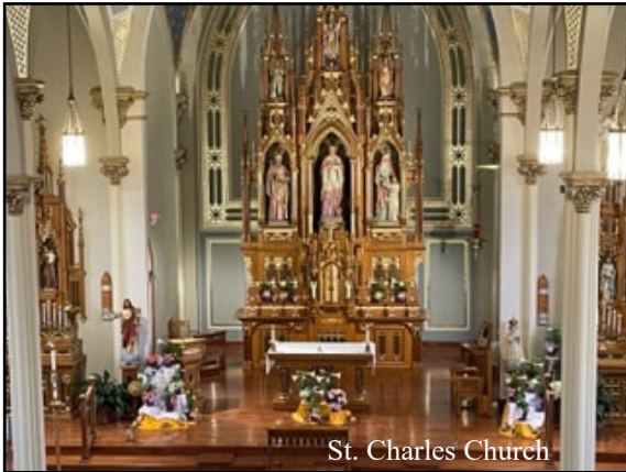
St. Charles Church

Thank you to everyone who gave memorials for flowers and helped to make our churches look beautiful for Easter!