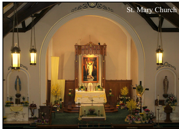
St. Mary Church

Thank you to everyone who gave donations and memorials for flowers and helped to make our churches look beautiful for Easter!