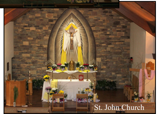
St. John Church