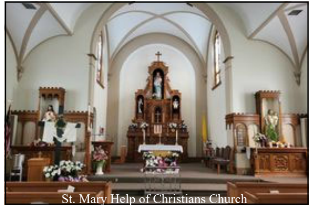
St. Mary Help of Christians Church