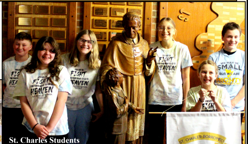
St. Charles Students