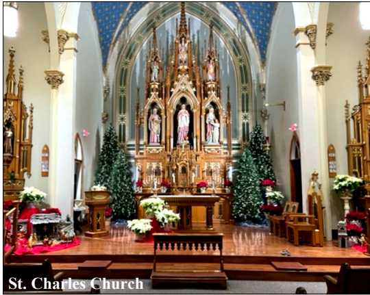
St. Charles Church

Thank you to all who gave donations for the flowers and decorations and to everyone who helped to make our churches beautiful for the Christmas season.