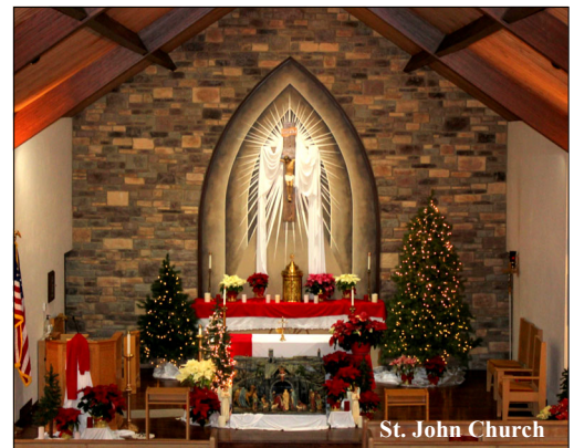
St. John Church