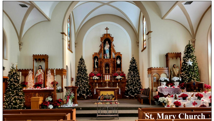
St. Mary Church