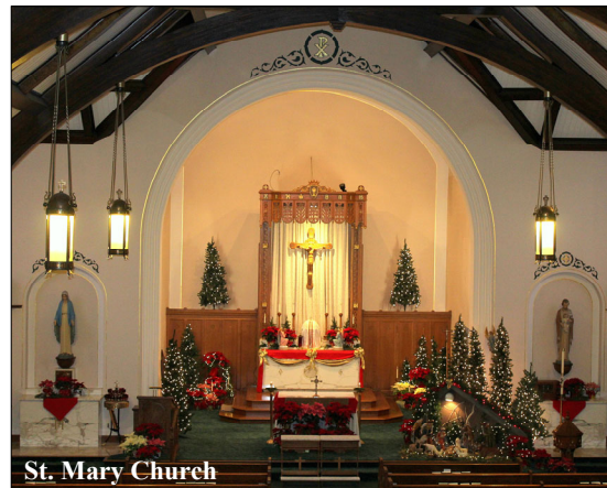
St. Mary Church

Thank you to all who gave donations for the flowers and decorations and to everyone who helped to make our churches beautiful for the Christmas season.